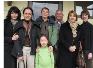
Bulgaria - Child Welfare and Adoption Issues-with a local family