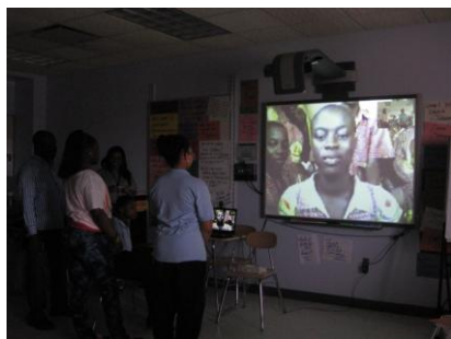
Skype session during which the students from Rochester are talking with students in Ghana.