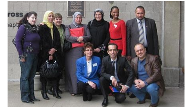
Iraq - Best Practices in NGO Management at the American Red Cross, Greater Rochester Chapter