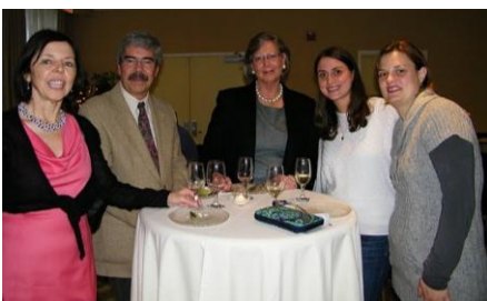
Language Intelligence Attendees