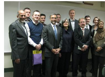
Bosnia-Herzegovina - Local Government in the U.S.-Center for Interfaith Studies and Dialogue, Nazareth College