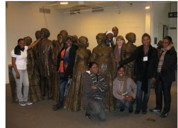
Haiti - Leadership Development for Women - Women's Rights National Historic Park in Seneca Falls