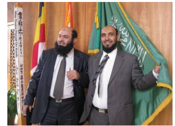
Two delegates from Saudi Arabia are delighted at seeing their flag.